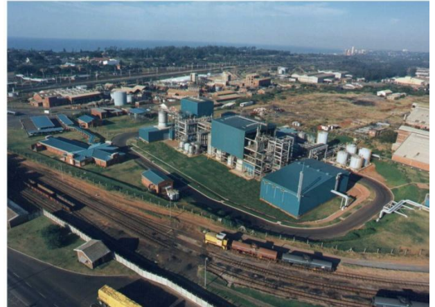
SABioproducts Lysine Manufacturing Plant Umbogintwini, Kwa-Zulu Natal coast, South Africa

SmartSURE™ supports a company's quality management systems by providing simple effective tools for reporting and investigating incidents, monitoring corrective actions and communicating learning points across the organisation. Email-driven workflow streamlines the incident review process and powerful management reports are available to detect trends and manage KPI's. Integration with ApplyIT's broader product suite allows safety activities and learning points to be easily integrated into day-to-day maintenance activities and plant operations.